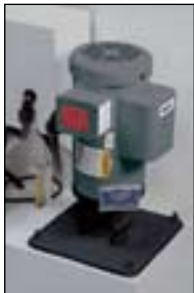
Dimensions: 50" h x 40" w x 51" d

Vertical seal-less pump —No vibrations and positive flow. Easy to service when needed.