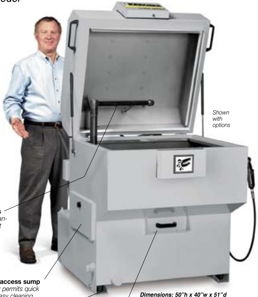
Shown with options

The 2518 Series is our top-of-the-line, top-load model with extra-capacity throughout. It comes standard with a time-tested chain drive assembly, virtually maintenance-free vertical seal-less pump, and disc oil skimmer that can be automated for convenience in disposing of oil. Extra-easy access to the sump and removable debris screen set it apart from other top-loaders on the market.