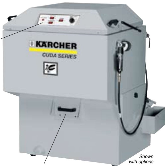
Shown with options

Control panel has simple controls for heater, turntable and wash-cycle operation, plus low water shut-off indicator.